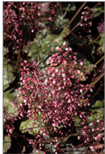
Frosted Violet Coral Bells flowers