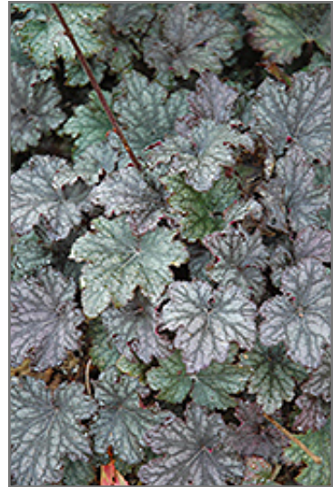
Frosted Violet Coral Bells foliage

Frosted Violet Coral Bells is recommended for the following landscape applications;