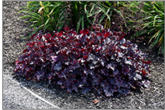
Plum Pudding Coral Bells

Plum Pudding Coral Bells is a fine choice for the garden, but it is also a good selection for planting in outdoor pots and containers. It is often used as a 'filler' in the 'spiller-thriller-filler' container combination, providing a mass of flowers and foliage against which the larger thriller plants stand out. Note that when growing plants in outdoor containers and baskets, they may require more frequent waterings than they would in the yard or garden. Be aware that in our climate, most plants cannot be expected to survive the winter if left in containers outdoors, and this plant is no exception. Contact our experts for more information on how to protect it over the winter months.