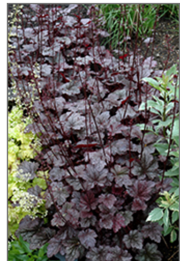
Plum Pudding Coral Bells in bloom