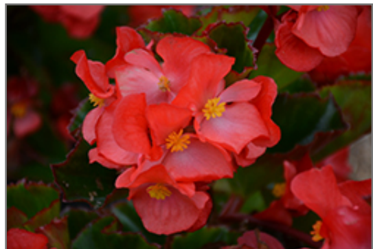
Megawatt Red Green Leaf Begonia flowers