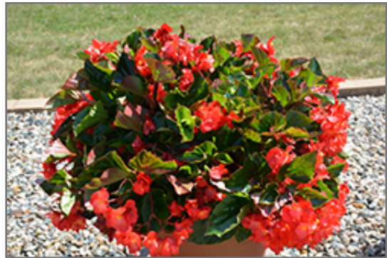
Megawatt Red Green Leaf Begonia in bloom

Megawatt Red Green Leaf Begonia is a fine choice for the garden, but it is also a good selection for planting in outdoor containers and hanging baskets. With its upright habit of growth, it is best suited for use as a 'thriller' in the 'spiller-thriller-filler' container combination; plant it near the center of the pot, surrounded by smaller plants and those that spill over the edges. It is even sizeable enough that it can be grown alone in a suitable container. Note that when growing plants in outdoor containers and baskets, they may require more frequent waterings than they would in the yard or garden.