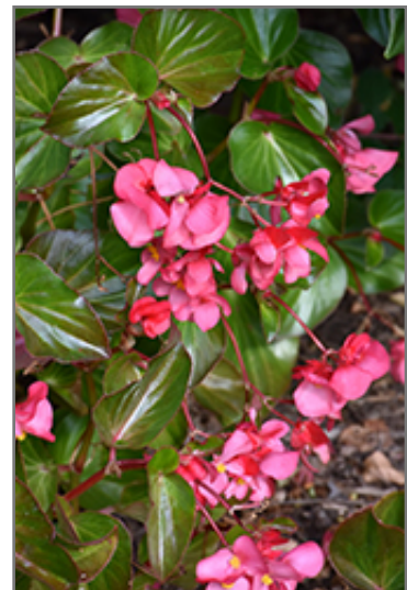
Megawatt Rose Green Leaf Begonia flowers