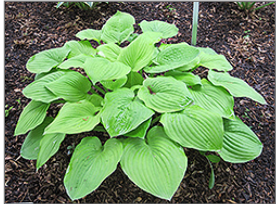
August Moon Hosta