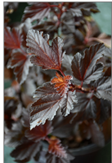
Fireside Ninebark flowers