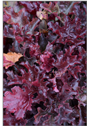
Dolce Cherry Truffles Coral Bells foliage