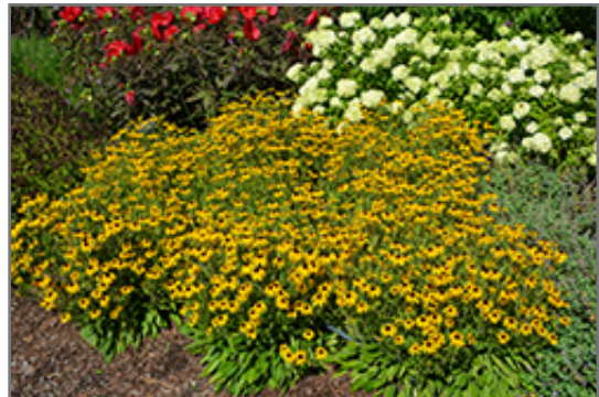
American Gold Rush Coneflower in bloom