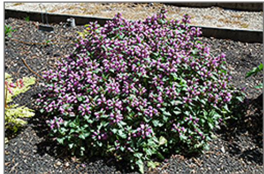
Beacon Silver Spotted Dead Nettle in bloom