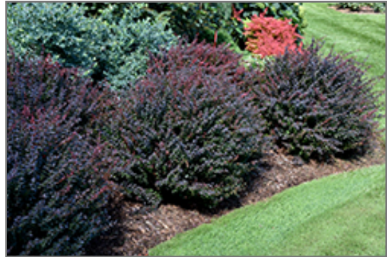
Sunjoy Mini Maroon Japanese Barberry

Sunjoy Mini Maroon Japanese Barberry is recommended for the following landscape applications;