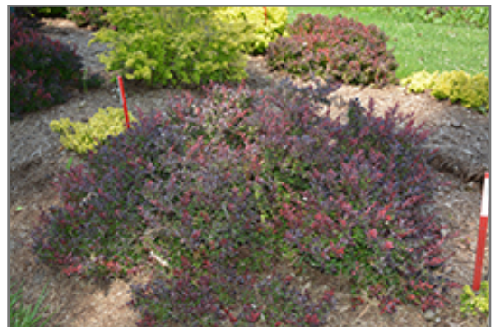
Sunjoy Todo Japanese Barberry