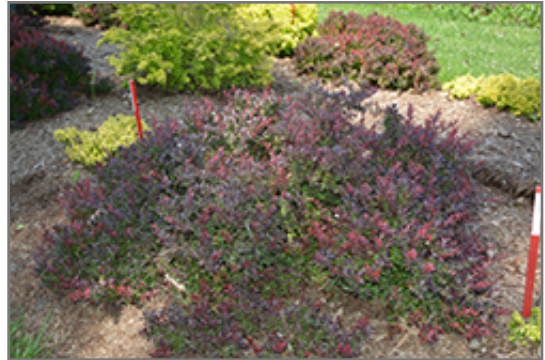
Sunjoy Todo Japanese Barberry

Sunjoy Todo Japanese Barberry will grow to be about 24 inches tall at maturity, with a spread of 24 inches. It tends to fill out right to the ground and therefore doesn't necessarily require facer plants in front. It grows at a medium rate, and under ideal conditions can be expected to live for approximately 20 years.