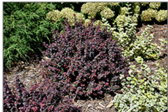
Sunjoy Todo Japanese Barberry