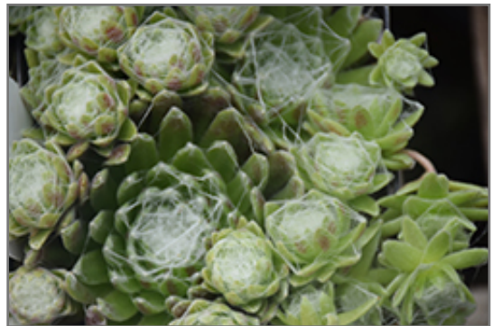
Cobweb Buttons Hens And Chicks