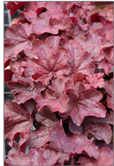
Northern Exposure Red Coral Bells foliage

Northern Exposure Red Coral Bells is recommended for the following landscape applications;