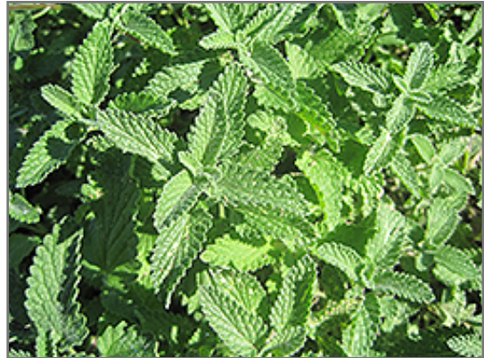
Walker's Low Catmint foliage

Walker's Low Catmint is a fine choice for the garden, but it is also a good selection for planting in outdoor pots and containers. It is often used as a 'filler' in the 'spiller-thriller-filler' container combination, providing a mass of flowers against which the thriller plants stand out. Note that when growing plants in outdoor containers and baskets, they may require more frequent waterings than they would in the yard or garden. Be aware that in our climate, most plants cannot be expected to survive the winter if left in containers outdoors, and this plant is no exception. Contact our experts for more information on how to protect it over the winter months.