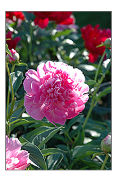
Bouquet Perfect Peony flowers