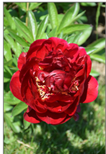
Buckeye Belle Peony flowers