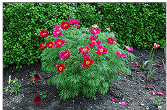
Fernleaf Peony in bloom