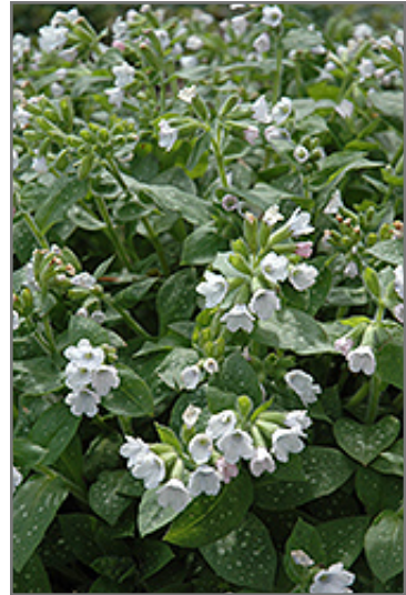
Sissinghurst White Lungwort flowers