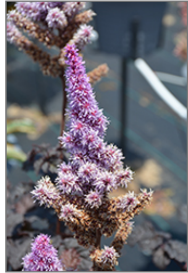
Dark Side Of The Moon Astilbe flowers

This is a relatively low maintenance plant, and is best cleaned up in early spring before it resumes active growth for the season. It is a good choice for attracting butterflies to your yard, but is not particularly attractive to deer who tend to leave it alone in favor of tastier treats. It has no significant negative characteristics.