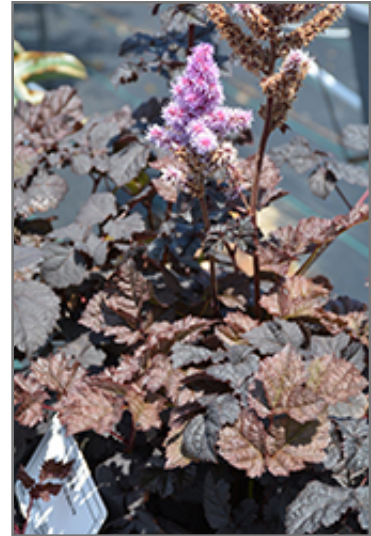
Dark Side Of The Moon Astilbe in bloom

Dark Side Of The Moon Astilbe will grow to be about 18 inches tall at maturity extending to 24 inches tall with the flowers, with a spread of 24 inches. When grown in masses or used as a bedding plant, individual plants should be spaced approximately 20 inches apart. Its foliage tends to remain dense right to the ground, not requiring facer plants in front. It grows at a medium rate, and under ideal conditions can be expected to live for approximately 10 years. As an herbaceous perennial, this plant will usually die back to the crown each winter, and will regrow from the base each spring. Be careful not to disturb the crown in late winter when it may not be readily seen!