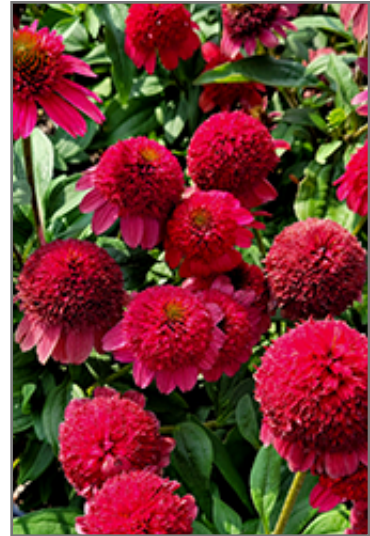
Sunny Days Ruby Coneflower flowers

Sunny Days Ruby Coneflower is an herbaceous perennial with an upright spreading habit of growth. Its medium texture blends into the garden, but can always be balanced by a couple of finer or coarser plants for an effective composition.