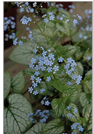
Jack Frost Bugloss flowers