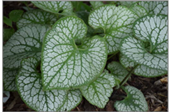
Jack Frost Bugloss foliage

This is a relatively low maintenance plant, and should be cut back in late fall in preparation for winter. It has no significant negative characteristics.