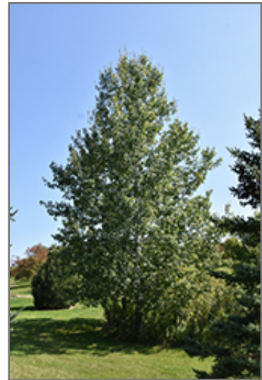
Trembling Aspen

Trembling Aspen is recommended for the following landscape applications;