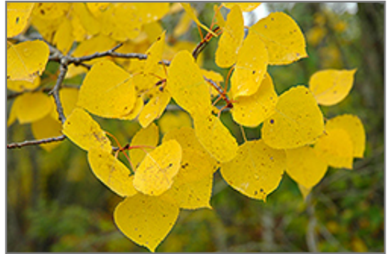
Trembling Aspen in fall

This tree should only be grown in full sunlight. It is an amazingly adaptable plant, tolerating both dry conditions and even some standing water. It is considered to be drought-tolerant, and thus makes an ideal choice for xeriscaping or the moisture-conserving landscape. It is not particular as to soil type or pH. It is quite intolerant of urban pollution, therefore inner city or urban streetside plantings are best avoided. This species is native to parts of North America.