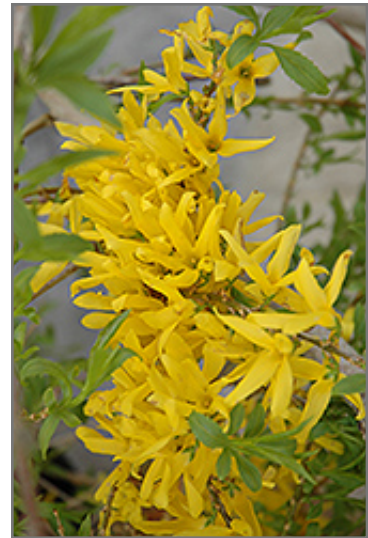
Gold Tide Forsythia flowers

Gold Tide Forsythia is recommended for the following landscape applications;