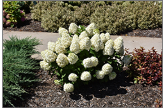
Little Lime Punch Hydrangea in bloom

Little Lime Punch Hydrangea makes a fine choice for the outdoor landscape, but it is also well-suited for use in outdoor pots and containers. With its upright habit of growth, it is best suited for use as a 'thriller' in the 'spiller-thriller-filler' container combination; plant it near the center of the pot, surrounded by smaller plants and those that spill over the edges. It is even sizeable enough that it can be grown alone in a suitable container. Note that when grown in a container, it may not perform exactly as indicated on the tag - this is to be expected. Also note that when growing plants in outdoor containers and baskets, they may require more frequent waterings than they would in the yard or garden. Be aware that in our climate, most plants cannot be expected to survive the winter if left in containers outdoors, and this plant is no exception. Contact our experts for more information on how to protect it over the winter months.