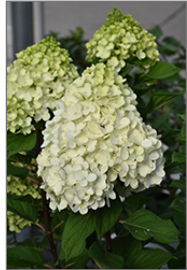
Little Lime Punch Hydrangea flowers

Little Lime Punch Hydrangea is recommended for the following landscape applications;