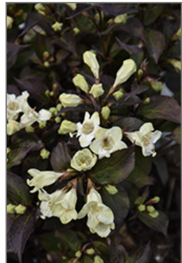
Wine & Spirits Weigela flowers