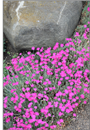
Firewitch Pinks in bloom

Firewitch Pinks is a fine choice for the garden, but it is also a good selection for planting in outdoor pots and containers. It is often used as a 'filler' in the 'spiller-thriller-filler' container combination, providing a mass of flowers and foliage against which the thriller plants stand out. Note that when growing plants in outdoor containers and baskets, they may require more frequent waterings than they would in the yard or garden. Be aware that in our climate, most plants cannot be expected to survive the winter if left in containers outdoors, and this plant is no exception. Contact our experts for more information on how to protect it over the winter months.