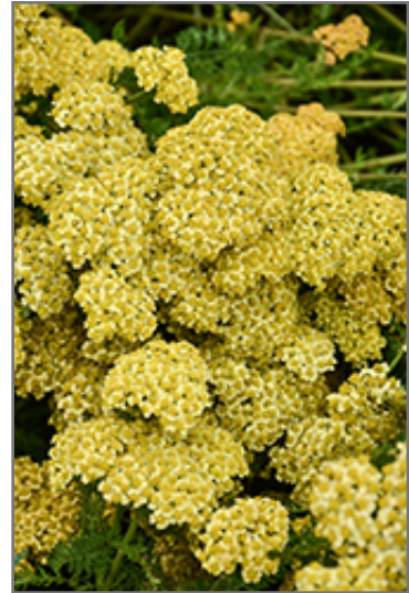
Milly Rock Yellow Terracotta Yarrow flowers