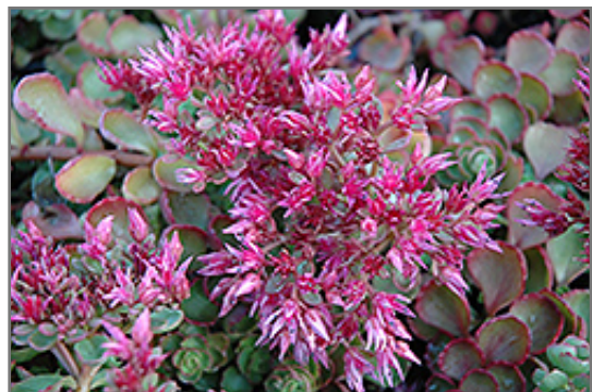
Fulda Glow Stonecrop flowers