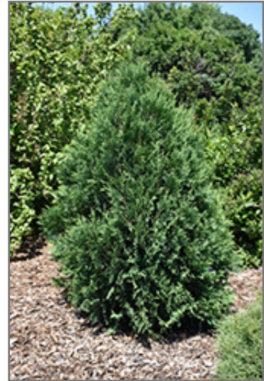
Technito Arborvitae