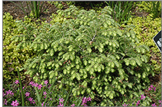
Moon Frost Hemlock

Moon Frost Hemlock is recommended for the following landscape applications;