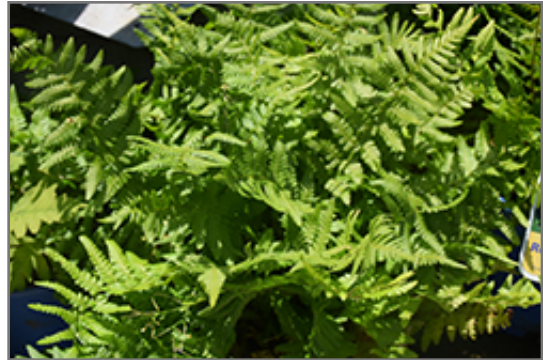
Robust Male Fern foliage

Robust Male Fern is recommended for the following landscape applications;