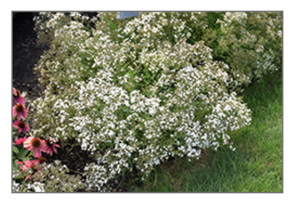
Festival Star Baby's Breath in bloom