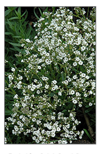
Festival Star Baby's Breath flowers