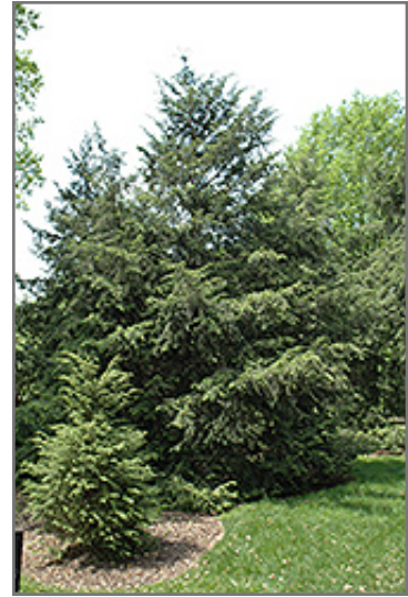
Canadian Hemlock

Canadian Hemlock is recommended for the following landscape applications;