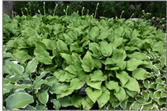
Royal Standard Hosta

Royal Standard Hosta is recommended for the following landscape applications;