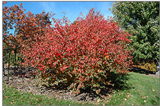
Korean Sun Pear in fall