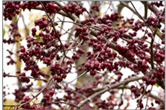
Purple Prince Flowering Crab fruit

This tree should only be grown in full sunlight. It prefers to grow in average to moist conditions, and shouldn't be allowed to dry out. It is not particular as to soil type or pH. It is highly tolerant of urban pollution and will even thrive in inner city environments. This particular variety is an interspecific hybrid.