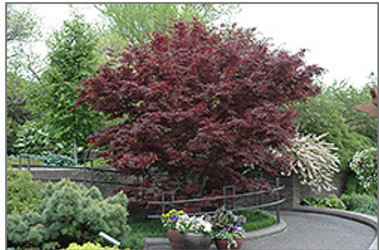
Bloodgood Japanese Maple

Bloodgood Japanese Maple is recommended for the following landscape applications;