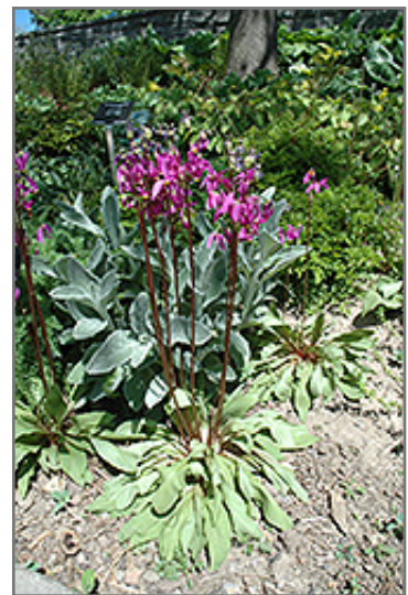
Aphrodite Shooting Star in bloom