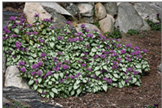
Purple Dragon Spotted Dead Nettle in bloom