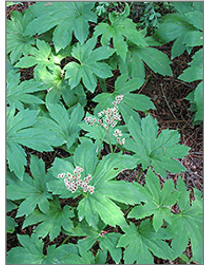
Crimson Fans Mukdenia flowers

Crimson Fans Mukdenia will grow to be about 12 inches tall at maturity extending to 18 inches tall with the flowers, with a spread of 24 inches. When grown in masses or used as a bedding plant, individual plants should be spaced approximately 20 inches apart. Its foliage tends to remain dense right to the ground, not requiring facer plants in front. It grows at a medium rate, and under ideal conditions can be expected to live for approximately 10 years. As an herbaceous perennial, this plant will usually die back to the crown each winter, and will regrow from the base each spring. Be careful not to disturb the crown in late winter when it may not be readily seen!