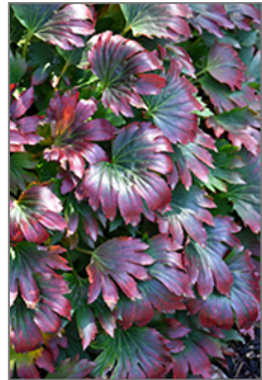
Crimson Fans Mukdenia foliage

This is a relatively low maintenance plant, and is best cleaned up in early spring before it resumes active growth for the season. It has no significant negative characteristics.