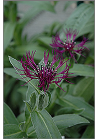
Amethyst Dream Cornflower flowers