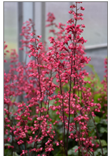
Paris Coral Bells flowers