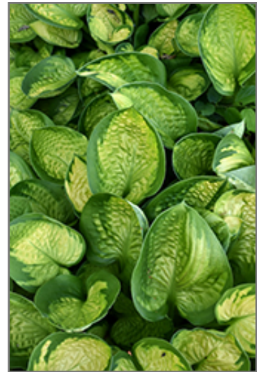
Rainforest Sunrise Hosta foliage

Rainforest Sunrise Hosta is recommended for the following landscape applications;