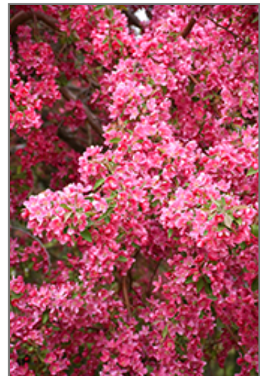
Prairifire Flowering Crab flowers