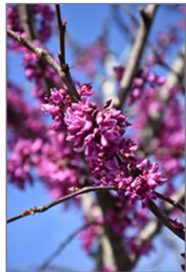
Eastern Redbud (tree form) flowers