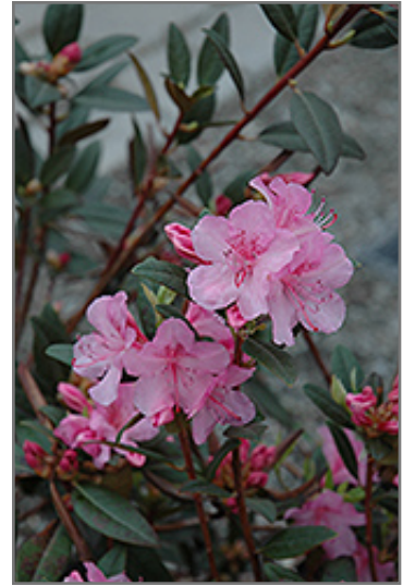
Aglo Rhododendron flowers

Aglo Rhododendron will grow to be about 3 feet tall at maturity, with a spread of 3 feet. It has a low canopy. It grows at a slow rate, and under ideal conditions can be expected to live for 40 years or more.