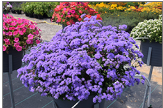
Artist Blue Flossflower in bloom