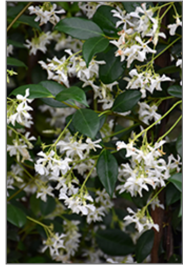
Confederate Star-Jasmine flowers