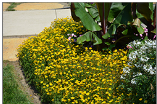
Goldilocks Rocks Bidens in bloom