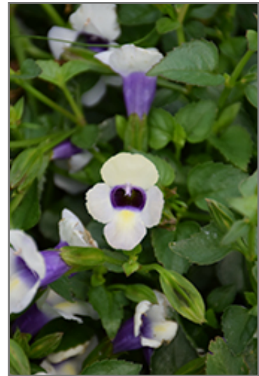
Catalina Grape-O-Licious Torenia flowers

This plant will require occasional maintenance and upkeep, and should not require much pruning, except when necessary, such as to remove dieback. It is a good choice for attracting bees and hummingbirds to your yard, but is not particularly attractive to deer who tend to leave it alone in favor of tastier treats. It has no significant negative characteristics.